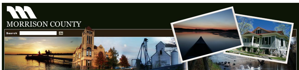
Morrison County Website Banner