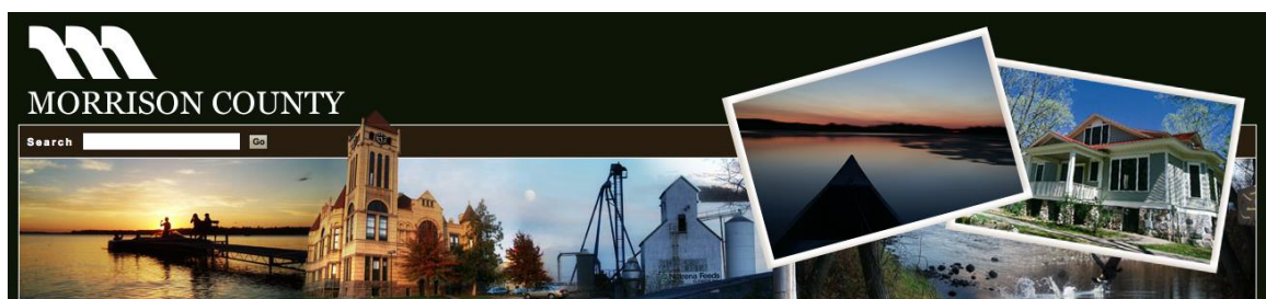
Morrison County Website Banner