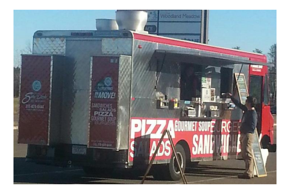
2013 – Connecting with supportive partners for our self-sustaining model.